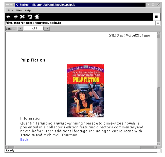
Figure 6. Individual movie page after choosing "Pulp Fiction" from the main menu.

When each of these pages opens, the contents are also rendered through the speech interface. User can navigate with mouse or through the speech recognition interface. A sample voice interface dialog is represented in Figure 7.